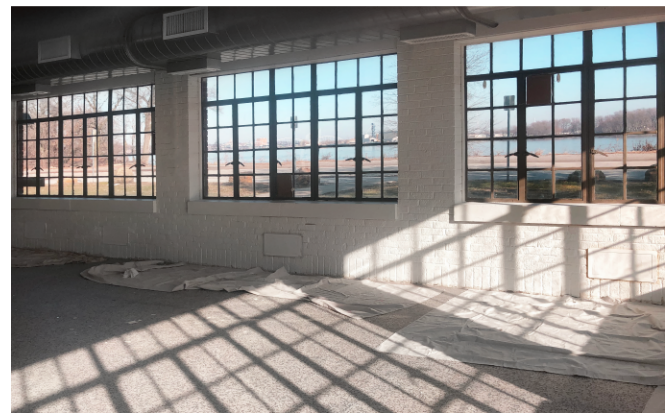
After Flood Vent Sealing Kits Were Installed