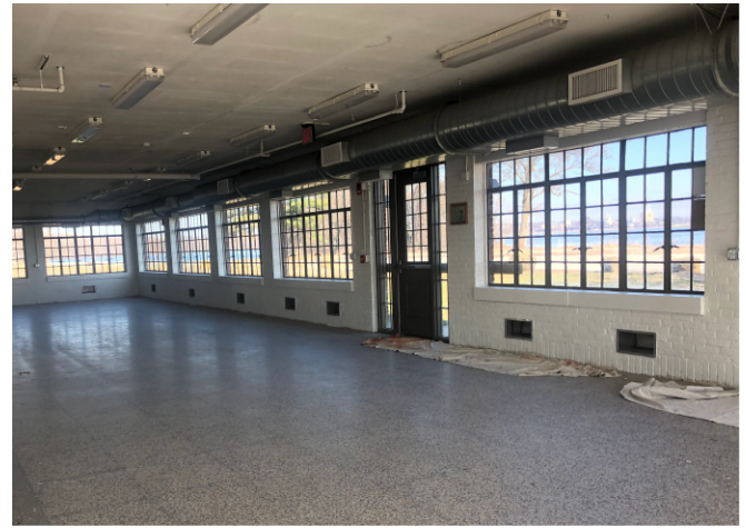
Before Flood Vent Sealing Kits Were Installed