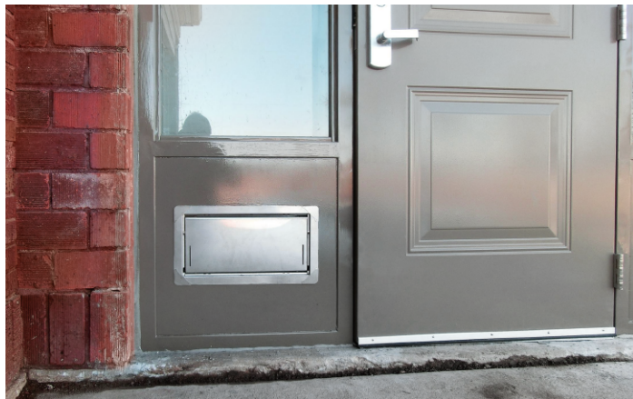
Flood Vent Installed in Lodge Entry Way

As a company, we strive ourselves on being the answer to uneasy flood related issues like this one. It's extremely humbling knowing we supplied the proper flood protection 5 years ago that kept the historic Credit Island Lodge safe and standing today. We're happy to know the lodge will continue to bring communities and families together for memorable events.