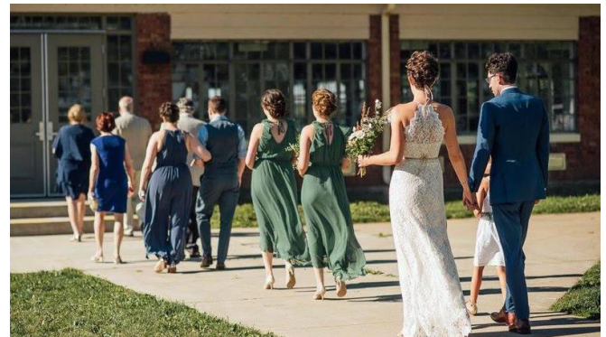
Weddings and events have uninterrupted building access before potential flood events due to wet floodproofing

Davenport Parks and Recreation workers checked on the Credit Island Lodge and found flood vents working as they should, allowing in floodwaters to prevent structural damage to the beloved building.